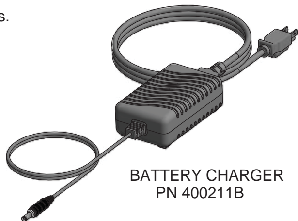
BATTERY CHARGER PN 400211B