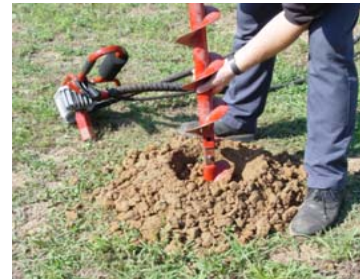
10 Snap extension to auger.