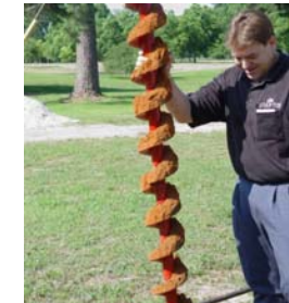
12 Remove handle, then remove auger and extension from hole.