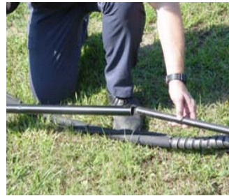
1 Slide round end of torque tube onto torque bar attached to handle.

Check the sharpness of the cutting blade frequently. If it becomes dull, check with your dealer or factory for a replacement. Do not use an auger blade which has worn even with the auger flighting. NEVER operate the earth drill with a damaged auger.