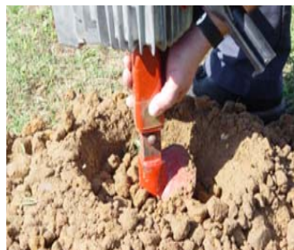
9 For greater depths, un-snap auger from transmission.