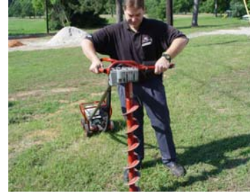
6 Stand with feet well clear of auger. Pull throttle lever in completely to start the auger turning.