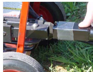
2 Snap torque tube onto connector at engine end.