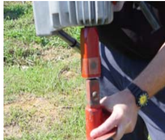
5 Attach auger to transmission adaptor.