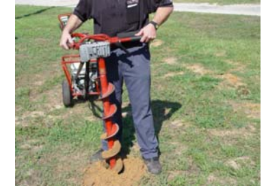
8 When hole is complete stop auger and pull out for clean hole.