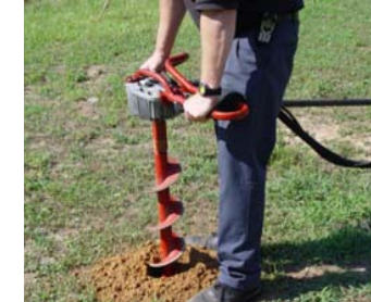
7 For safety, always keep leg pad against leg while digging.