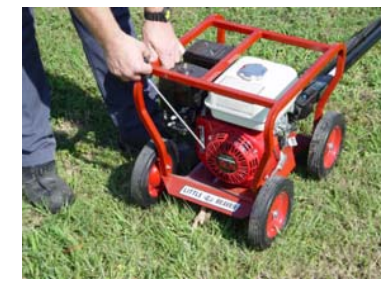
4 Starting position: pull starter rope.